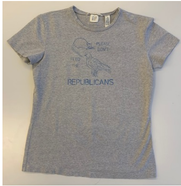
"Don't feed the Republicans," 2000s. Cotton T-shirt. Keight Bergmann Zinester Ephemera Collections circa 1990s - 2000s.