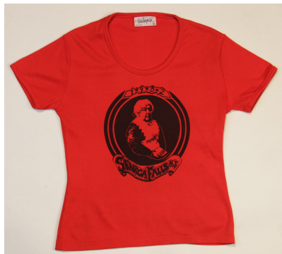
"1982 Seneca Falls," 1982. 50/50 cotton and polyester blend single stitch T-shirt. Freda Leinwand Collection, 1947-2007.