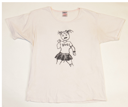
"girl," circa 2000s. Double sided print cotton T-shirt. Lauren Jade Martin Zinester Ephemera Collection, 1993-2003.