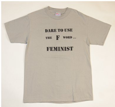
"Dare To Use The F Word," circa 1990s. Cotton single stitch T-shirt. Barnard Center for Research on Women records, 1962-2019.