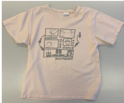
"Boston free dance movement," 2000s. Cotton T-shirt illustrated by Marissa Falco. Keight Bergmann Zinester Ephemera Collections circa 1990s - 2000s.