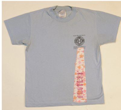
"Protest," circa 2000s. Cotton double sided print T-shirt with applique. Sara Jaffe Zinester Ephemera Collection, circa 1990s through 2000s.