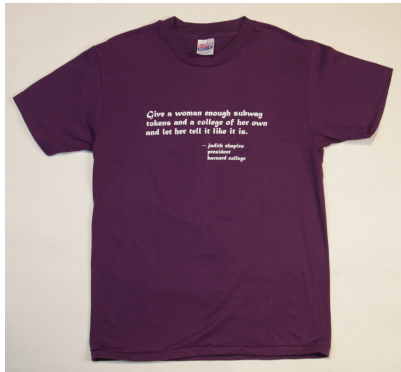
"Give a woman enough subway tokens...," circa 1990s. Cotton single stitch T-shirt. Barnard Center for Research on Women records, 1962-2019.