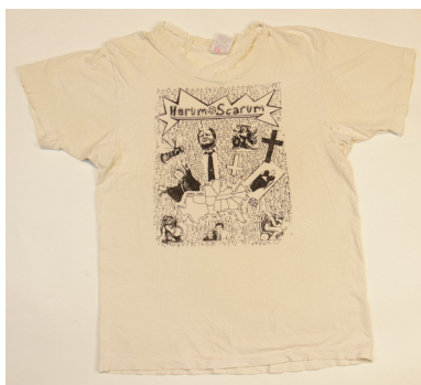
"Harum Scarum," circa 1990s. Cotton band T-shirt. Sara Jaffe Zinester Ephemera Collection, circa 1990s through 2000s.