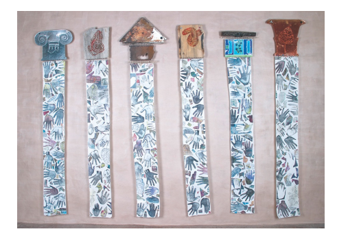
Palm Trees with Capitols, 2000 Trees: laser transfer prints on cloth, Capitols: found metal, copper, wood-burning on wood Each Palm Tree approximately 76" x 11"